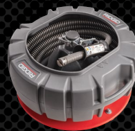
SECTIONAL CABLE CARRIER Cat. # 61708

The new sectional cable carrier lets you transport cables in and out of the jobsite faster and cleaner. A sturdy base keeps the carrier secure, so you can spin sectional cables in or out of the housing unit efficiently. The carrier keeps soiled cables contained to mitigate jobsite contamination.