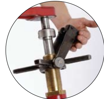
Flip Clamp on Star Feed System