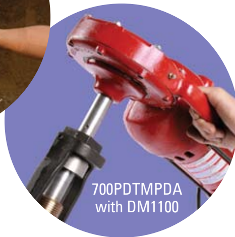
700PDTMPDA with DM1100

Contact Reed to learn more about adding power to drilling and tapping jobs.