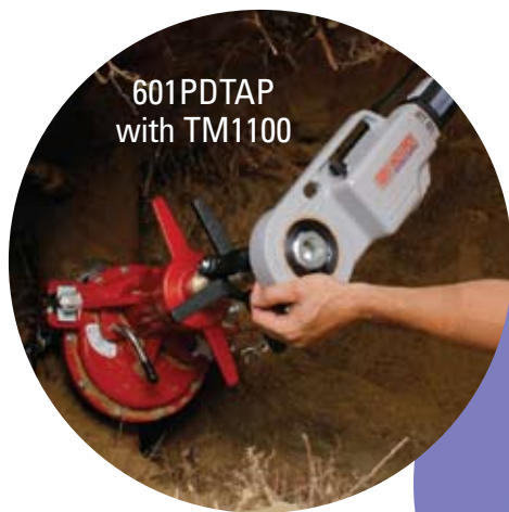
601PDTAP with TM1100